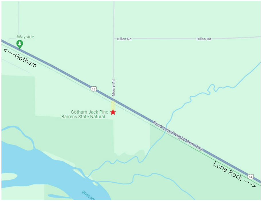
Moore Road location.